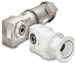
2000 Series Washdown Boston Gear