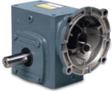
Worm Gear Speed Reducer 700 Series Boston Gear

700 Series is known throughout the industry for its durable, efficient, and trouble-free performance. And with our Reducer Express™ service, we'll ship any of our 15 million different speed reducer combinations, in stock or not, by air within 24 hours - or we'll pay the freight.