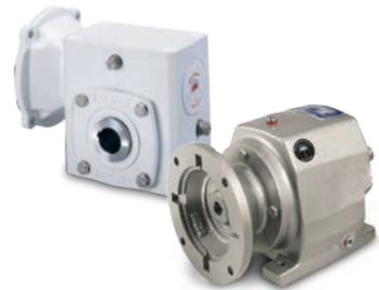
700 Series Washdown Boston Gear

Bost-Kleen™ and Stainless Bost-Kleen™ speed reducers are robust enough to handle caustic and high pressure washdown, strong enough to go 24/7, and more economical than alternative models.