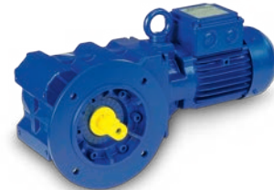
Helical Bevel-Gear Motor Series BK Bauer Gear Motor

Power-dense, right-angle, bevel-gear motors ensure the highest efficiency especially when used with frequency inverters.