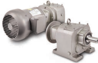
Helical & Helical Bevel Gearing 2000 Series Boston Gear

Altra's competitive displacement helical gear product offering is designed with critical dimensions equivalent to select competitor gear drives.