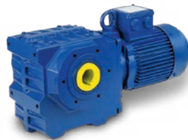
Helical Worm-Gear Motor Series BS Bauer Gear Motor

Economical, right-angle, worm-gear motors install easily in the tightest applications.