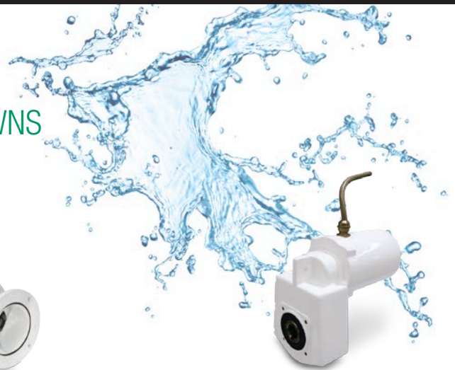
Clean Drive Bauer Gear Motor