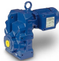
Shaft-Mounted Gear Motor Series BF Bauer Gear Motor

Shaft-mounted gear motors with integrated torque arm are easily integrated and economically applied.